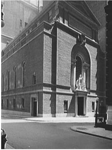
Church of Our Lady of Victory 60 William Street NY, NY 10005