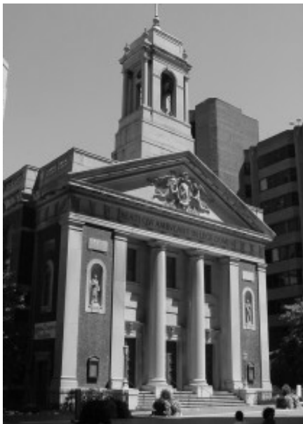
Church of Saint Andrew 20 Cardinal Hayes Place NY, NY 10007 PH: 212-962-3972