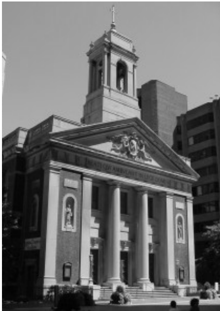
Church of Saint Andrew 20 Cardinal Hayes Place PH: 212-962-3972