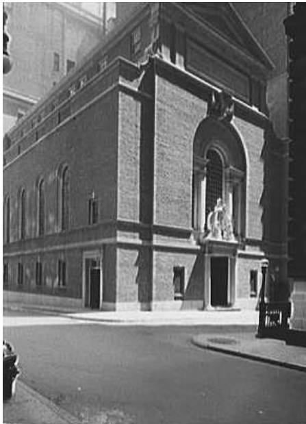
Church of Our Lady of Victory 60 William Street PH: 212-422-5535, FAX: 212-785-4457