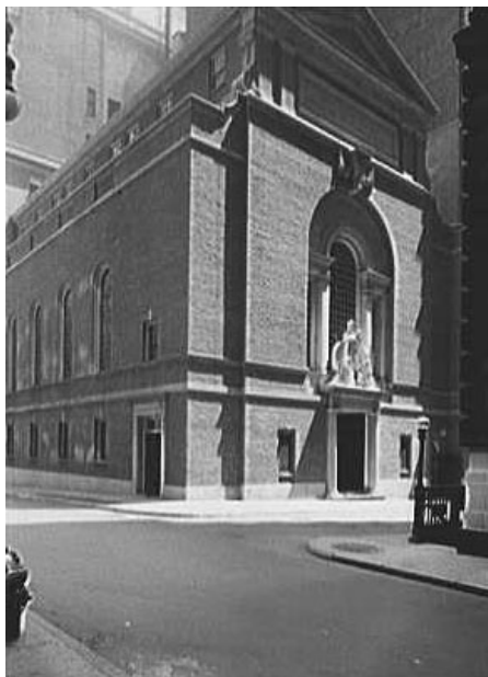
Church of Our Lady of Victory 60 William Street PH: 212-422-5535, FAX: 212-785-4457