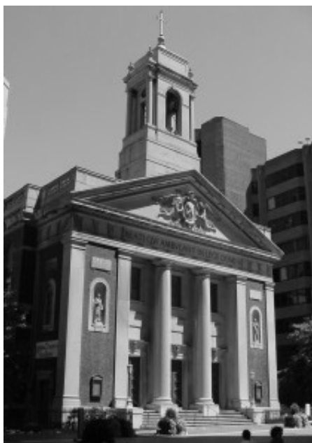
Church of Saint Andrew 20 Cardinal Hayes Place PH: 212-962-3972