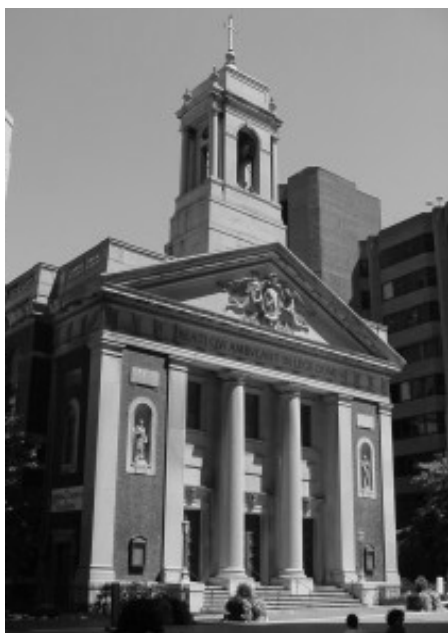
Church of Saint Andrew 20 Cardinal Hayes Place PH: 212-962-3972