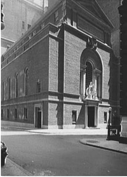
Church of Our Lady of Victory 60 William Street PH: 212-422-5535, FAX: 212-785-4457