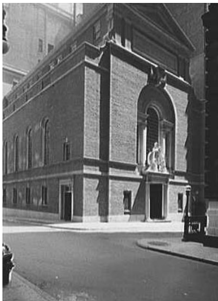
Church of Our Lady of Victory 60 William Street PH: 212-422-5535, FAX: 212-785-4457