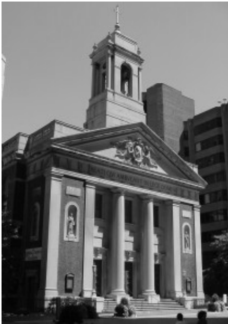
Church of Saint Andrew 20 Cardinal Hayes Place PH: 212-962-3972